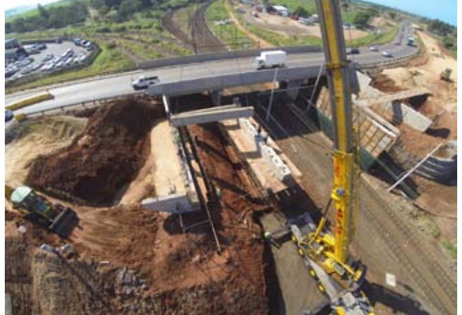
Lifting and placing the first beams for the new bridge.

Within the next four months the upgrade of the John Ross Parkway will be all but completed and years of traffic congestion and frustrations will become distant memories.