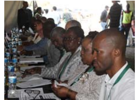
City of uMhlathuze councillors get down to business.