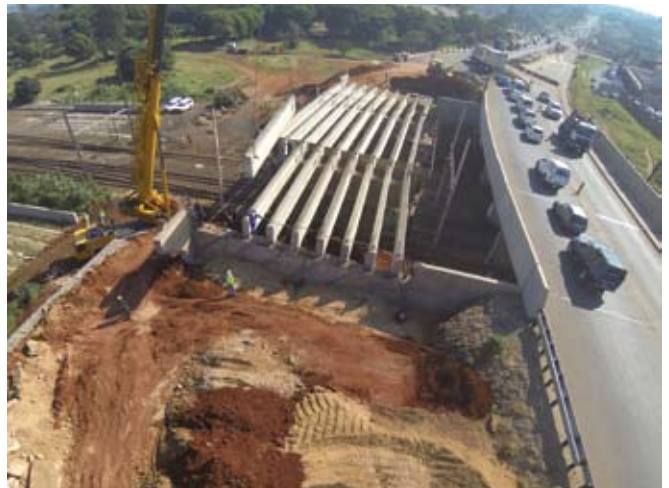
Placing the final beam in the third section.