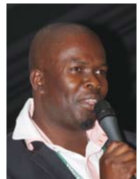
uThungulu District Municipality Mayor, Thulani Mashaba, offers a message of support.