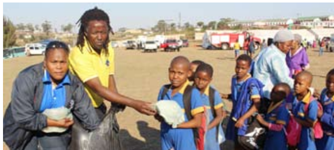
Food parcels were handed out to community members, for some it was a long day, as they had started gathering at midday in anticipation of the council meeting.