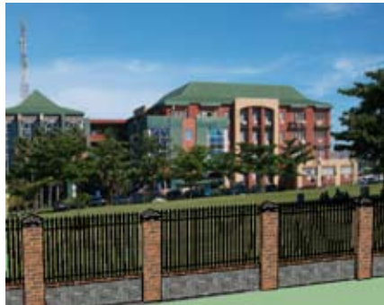
Above: One of the fencing options presented to Exco that would complement the Civic Centre building.

Another report will serve before Exco in the near future indicating the availability of budget to complete the project, which is estimated at between R975 000 and R1,2 million, as well as the time frame for the project.