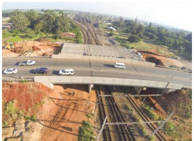
With all the beams in all three sections placed, the next stage is casting diaphragm walls and pouring the concrete deck which has to cure before the final black top is applied.