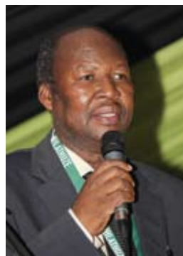
Mayor Elphas Mbatha delivers his mayoral message.