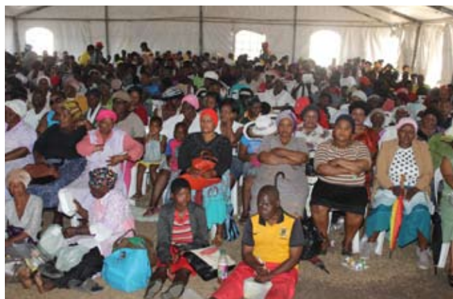
The Ngwelezane community turned out in their numbers at the Nongweleza Sport Ground in Ward 25 to attend the Council meeting.

“By the very definition of a democracy we are a government of the people, by the people, for the people,” he added.