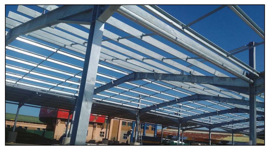
Richards Bay Taxi Rank is also nearing completion.

The two facilities follow more than 50 new stalls built at Nseleni Taxi Rank. The plan for the new eNseleni Taxi Rank is also on the pipeline.